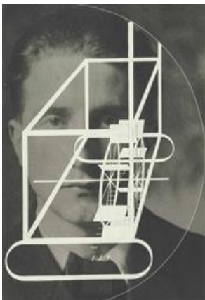
Man Ray (1890–1976), Marcel Duchamp and his 'Glider Containing a Water Mill in Neighboring Metals', c. 1923 . (estimate: $50,000 - 70,000)