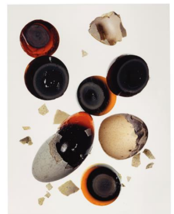
Irving Penn (1917-2009), 1,000 Year Old Eggs (A), New York, 2003 , (estimate: $20,000-30,000)