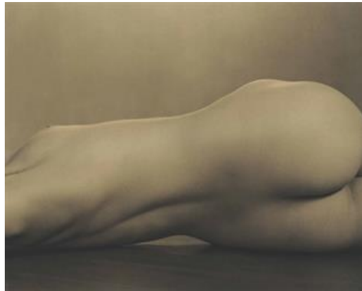
Edward Weston (1886–1958) Nude, 1925 (estimate: $400,000-600,000)