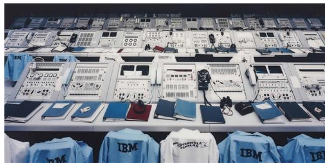
Thomas Struth (B. 1954), Control Panel, Kennedy Space Center, Cape Canaveral, 2008 . (estimate: $100,000 - 150,000)