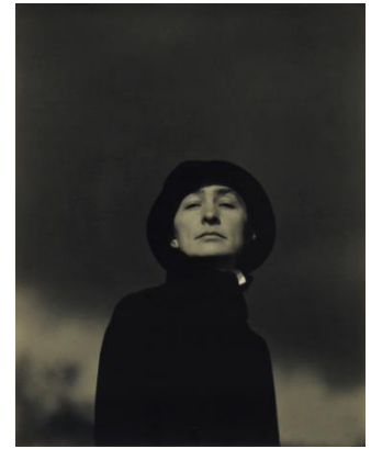
Alfred Stieglitz (1864-1946), Portrait of Georgia No. 1, 1923 , (estimate: $60,000-80,000)

Photographs Including Property Sold to Benefit the Elton John AIDS Foundation will commence with a selection of 25 works sold to benefit the Elton John AIDS Foundation. This sale holds great personal significance for the Oscar and Grammy Award-winning star. 'It's my 70th birthday, and the 50th anniversary of my songwriting partnership with Bernie Taupin,' Sir Elton stated. Please see dedicated release here.